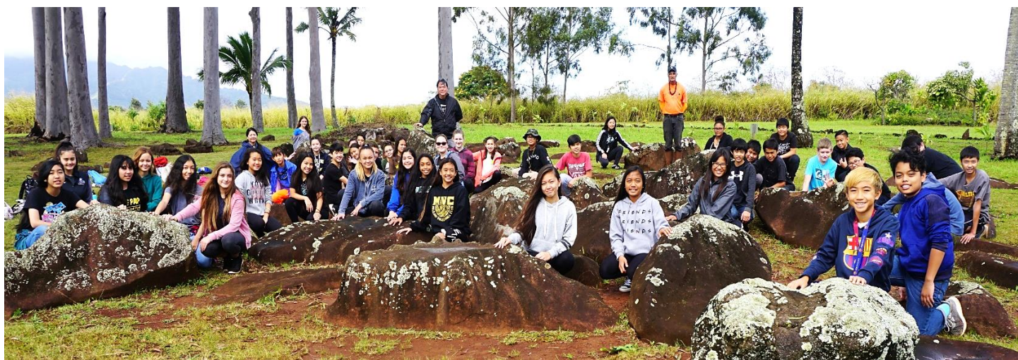
Mahalo to Mililani Mauka Middle School